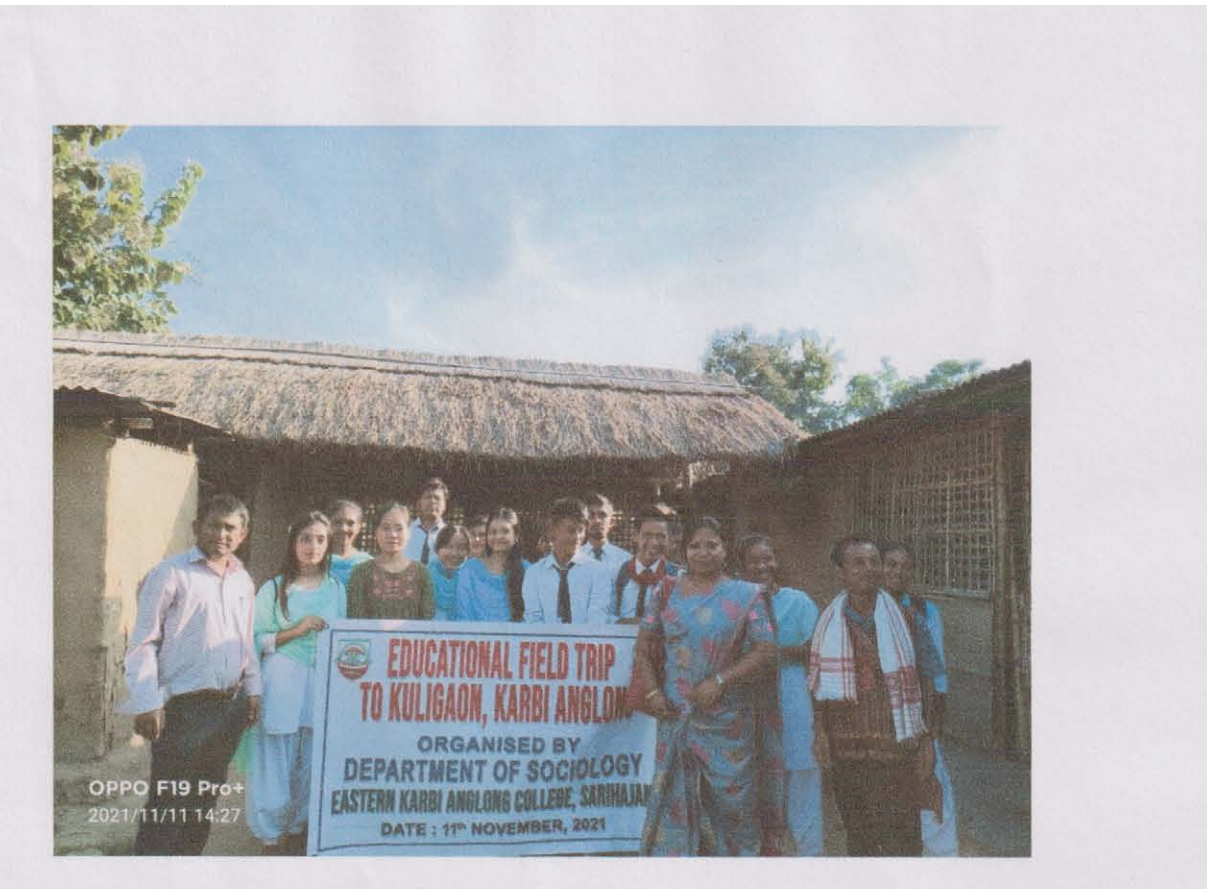
Field Visit by the Department of Sociology